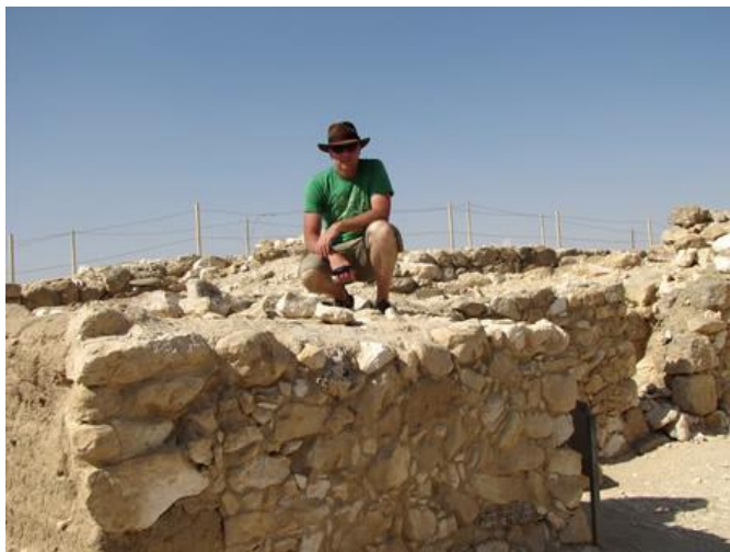
Altar in Arad high place

High Place in Arad - In the upper city of Arad is an Israelite Temple, or High Place, of worship. These were a violation of the Law of God. This picture is taken from the outer court with the altar being the square formation to the right. There is a stone slab on top. This had been covered with dirt around 701 BC during Hezekiah's reform. The little opening in the wall behind the altar leads into a long room that would be the holy place with the lamp stand. The Most Holy Place is up the four steps into the little room in the back.