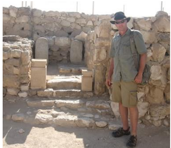
Holy Place with two altars for two gods.