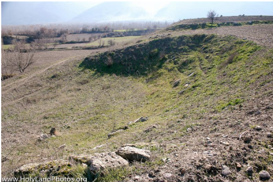
Remains of an unexcavated small theater or an Odeon. This view is looking south while standing on the tel. (Map from Generation Word) Photos from Carl Rasmussen, holylandphotos.org)