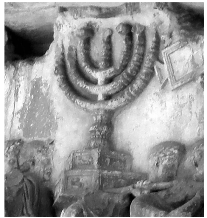
The Golden Lamp Stand from Herod's Temple of 70 AD.