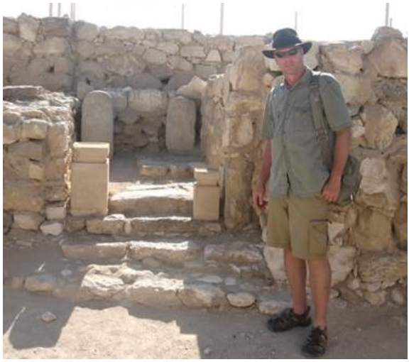
Holy Place with two altars for two gods.