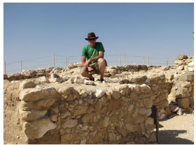
Altar in Arad high place

High Place in Arad - In the upper city of Arad is an Israelite Temple, or High Place, of worship. These were a violation of the Law of God. This picture is taken from the outer court with the altar being the square formation to the right. There is a stone slab on top. This had been covered with dirt around 701 BC during Hezekiah's reform. The little opening in the wall behind the altar leads into a long room that would be the holy place with the lamp stand. The Most Holy Place is up the four steps into the little room in the back.